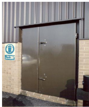
Leaf and Half Doors